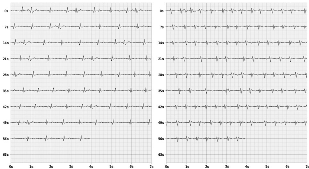
Figure 4 False-positive ECG tracings recorded by the MyDiagnostick. Left: an example of normal sinus rhythm with frequent premature ventricular extra-systoles. Right: an example of atrial flutter with an irregular coupling interval.

both hands for 1 minute and please report the color of the light; is it green or red.’ In contrast to other solutions including smartphone and blood pressure devices, 17,18 recording and reliable analysis of the ECG for detection of AF is embedded in the MyDiagnostick. This allows patients to monitor their rhythm anywhere-anytime, without the need for a communication channel, base station, or support from a health care professional. The 100% sensitivity allows the health care provider to only check the red-labelled ECGs to see whether the MyDiagnostick correctly identified AF. The high specificity prevents frequent ‘false alarm’, minimizing patient’s anxiety and workload for the health care professional.