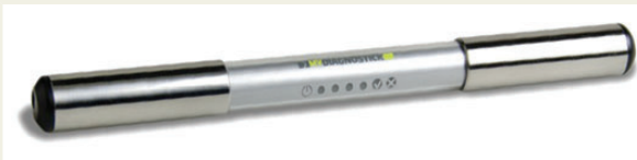
Figure 1 The MyDiagnostick device.

The MyDiagnostick ( www.mydiagnostick.com , MyDiagnostick Medical BV) is intended to discriminate AF from a normal cardiac rhythm (normal sinus rhythm, NSR) based on the ECG. This is achieved by an easy accessible device that can be used by both care providers like general practitioners, nurses, cardiologists and patients. The device has the shape of a stick (length 26 cm, diameter 2 cm) with metallic electrodes at both ends as shown in Figure 1 . The MyDiagnostick does not depend on any infrastructure or communication channels and can be used anytime, anywhere by simply holding the device in both hands for 60 s until the result is revealed. While holding the device, it will flash on the rhythm of the detected heartbeat. After 1 min, the MyDiagnostick either turns green, indicating a normal cardiac rhythm, or red in the case of AF. The MyDiagnostick has no buttons to select functions and switches automatically on when holding the device and will switch off after it has revealed the diagnostic result (red or green light) to the user. Due to the intuitive nature of the MyDiagnostick, diagnosis for AF can be